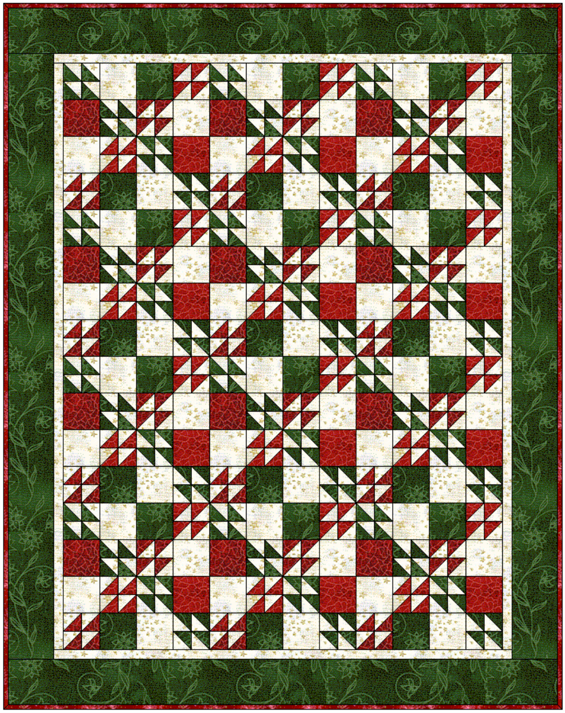
61" x 77"

...or snuggling under this charming quilt, you'll be dreaming of sugarplums and Christmases yet to come. Choose 3 stunning fabrics, do some simple strip cutting, and stitch squares and easy half-square triangles together using updated techniques to create this, surprisingly, uncomplicated quilt.