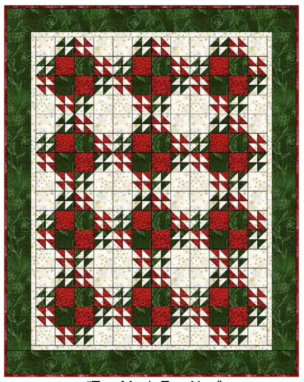
"Too Much Egg Nog"