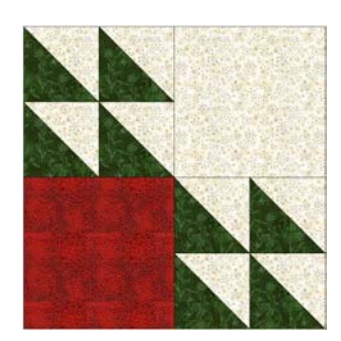
Make 24 blocks using (8) green HST, one white 4 ½" square and one red 4 ½" square.

Once half-square triangles are made, arrange eight of them to make Under the Mistletoe blocks as pictured below. Each completed block should measure 8 ½" (unfinished).